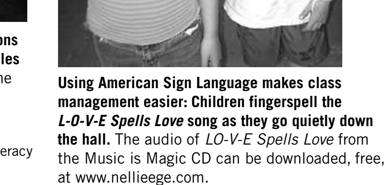
© 2005 Nellie Edge - Excellence in Kindergarten Literacy www.nellieedge.com