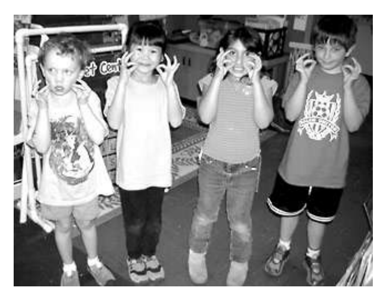
Sign language builds comprehension by creating internal images of language. These children are signing "cat" by tracing the cat's whiskers.