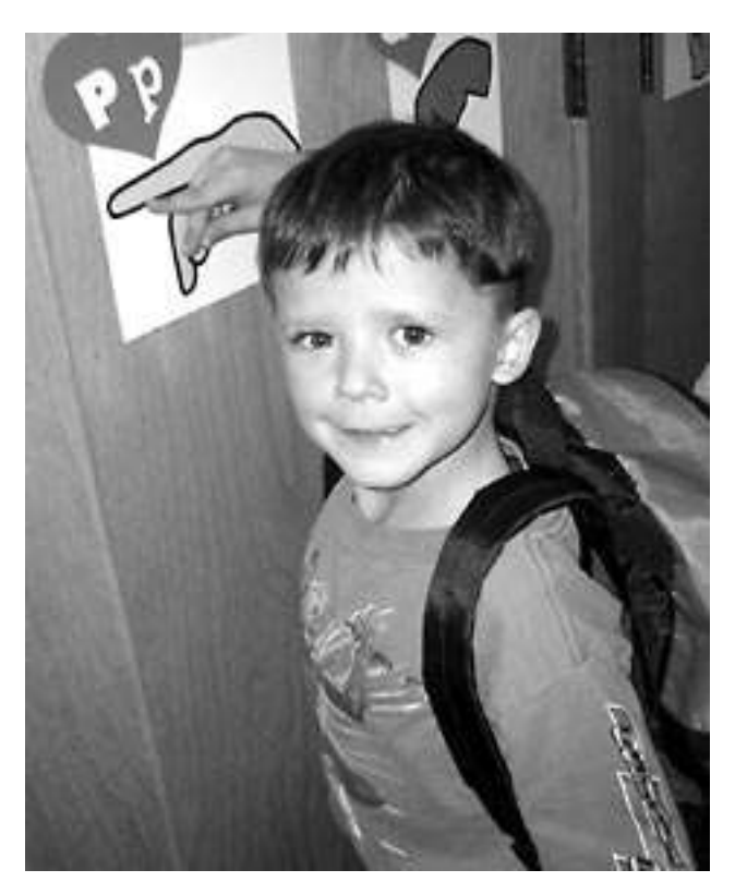
Children love to practice the sign language ABCs during transition times and while lining up for lunch, recess or the end of the day. They proudly practice at home. (For ABC cards, see Favorite Sign Language Resources .)

© 2005 Nellie Edge - Excellence in Kindergarten Literacy www.nellieedge.com