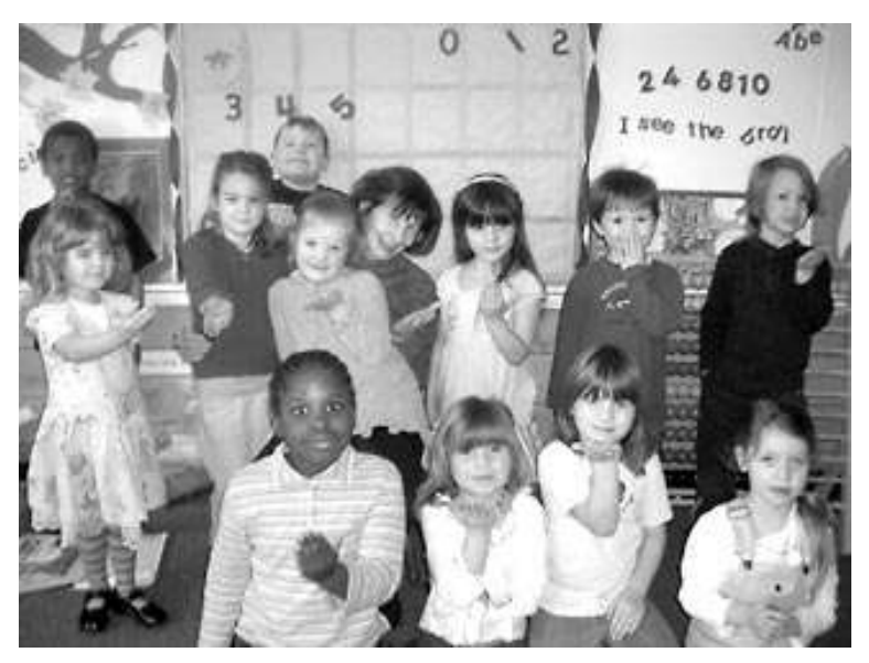
Sign language is a great tool for class management. It keeps our young friends engaged and focused. Children easily learn to understand and sign "yes," "no," "bathroom," "focus..." These children are signing "thank you" to show their appreciation.