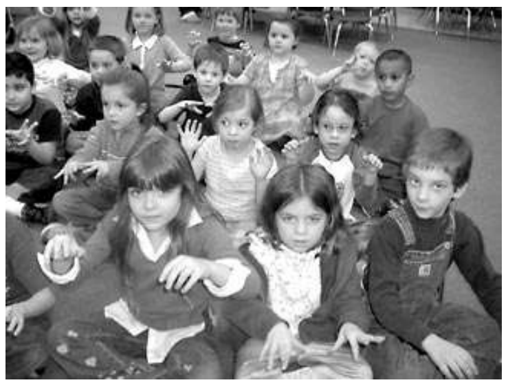
Singing and signing enhances speaking skills: Young children who are fortunate enough to learn ASL through the accelerated language medium of songs have an early and life-long advantage in developing expressive, dynamic speaking skills. Children are signing "rain."