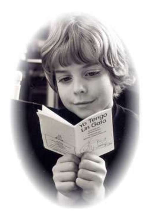
After children have learned the sign language for a song or rhyme, they can also read the words. This boy is reading the Yo Tengo Un Gato/ I Have A Cat Little Book. Sign language provides a powerful bridge between English and Spanish.