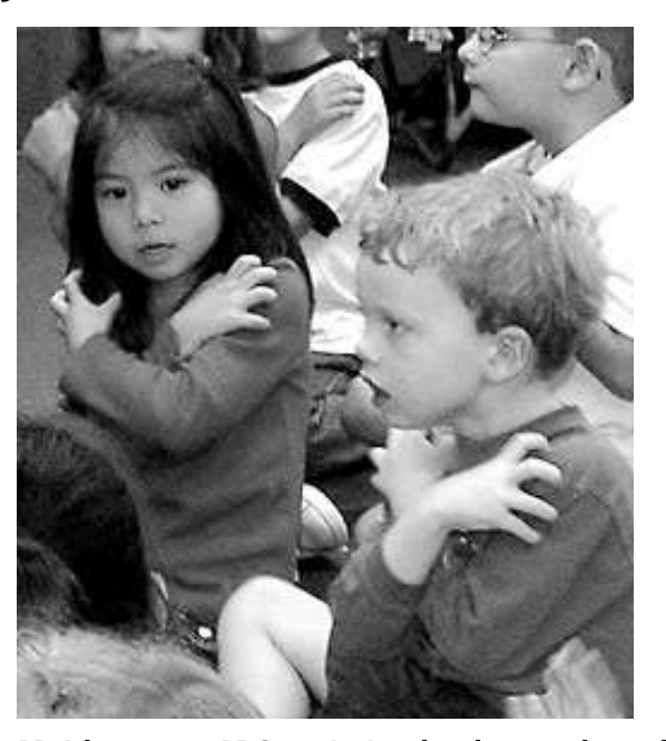
Multisensory ABC and phonics immersion with sign language accelerates knowledge of the alphabetical system. These children are signing and signing b, "b" bear from The ABC Sign Language and Phonics Song, by Nellie Edge.

© 2005 Nellie Edge - Excellence in Kindergarten Literacy www.nellieedge.com