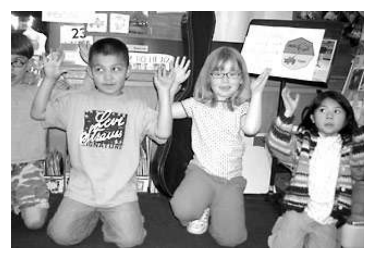
Children are so proud of themselves when they can sign. They love to sign applause (bravo) in Exact Signed English: Hands moving excitedly to the side of the forehead. Teachers enjoy how quiet the applause is.