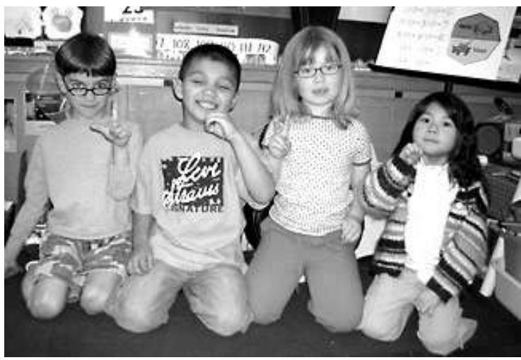
Fingerspelling builds kinesthetic memory connections for letters and sounds and develops the small muscles necessary for writing. Here children are signing the word "I-o-v-e."