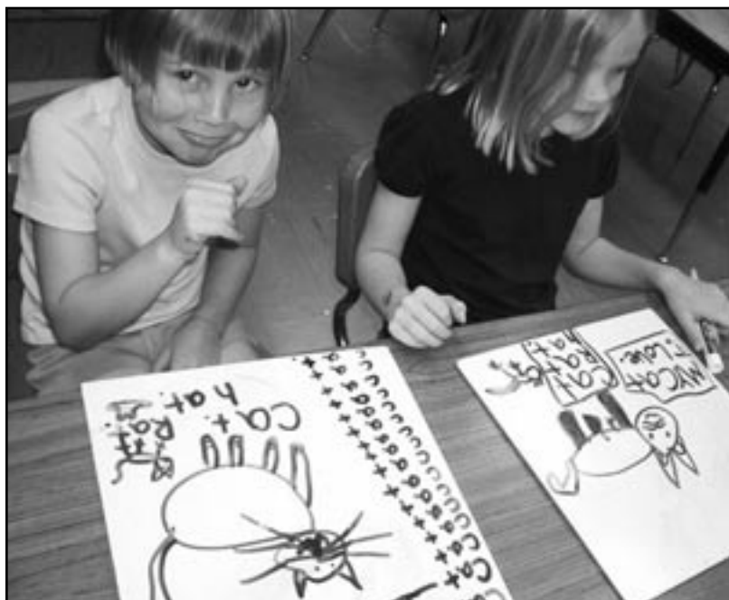
Timed "brain exercises" build fluency with important high-frequency words. Phonics skills are practiced as students learn to write. Drawing enhances the writing process.