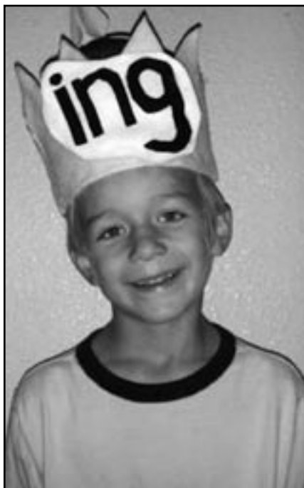
Imaginative strategies support children's transition from "kid writing" to adult writing: The King of "ing" builds memory connections.