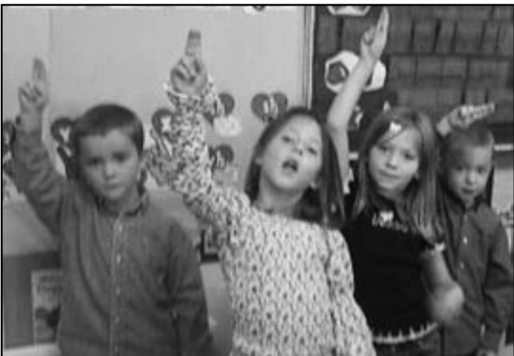
The "O" Dance teaches the counter-clockwise motion for o,c,a,d,g. Efficient handwriting skills support fluency instruction.

Soon we can read, write, and spell "I love you" with confidence and pride.