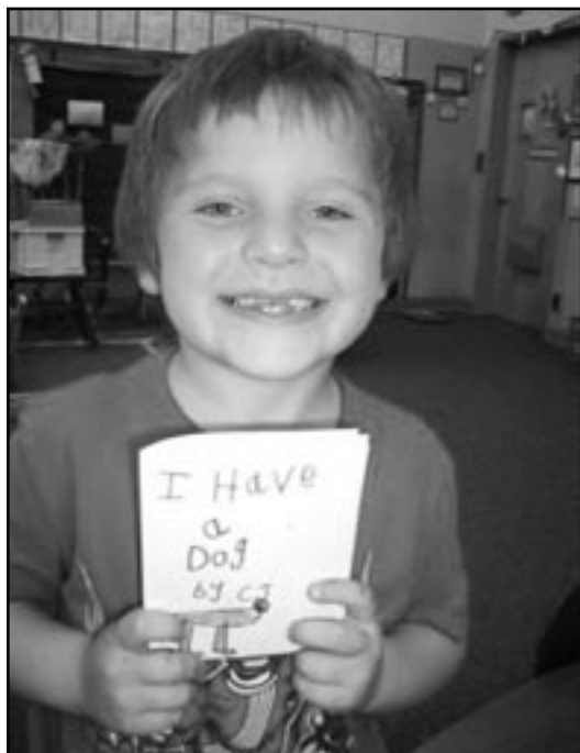
We get to make "really cool books": Hands-on literacy centers reinforce skills.