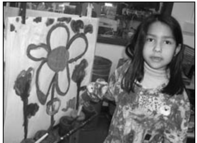
Our curriculum is rich in the arts. Painting and learning to draw with detail supports learning to write with detail.

Children Love Coming to School: A Nurturing Environment Builds Community and Positive Discipline Helps Children Want to Do What is Right