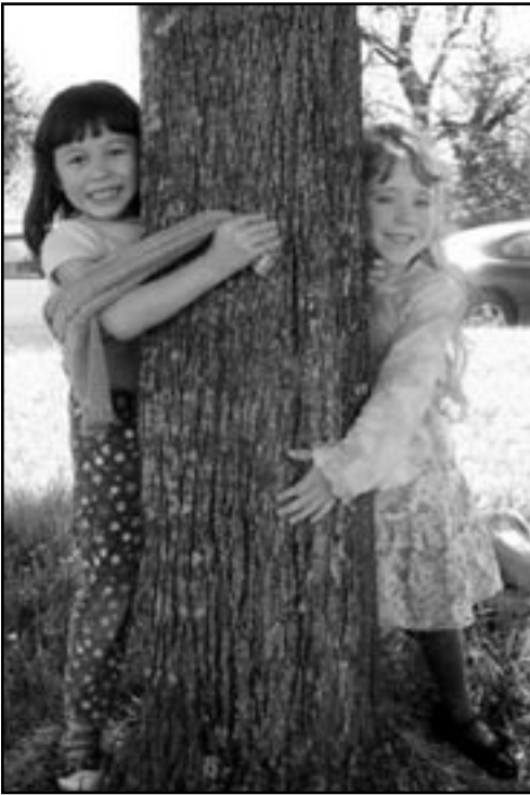
We study about the natural world outside the classroom.