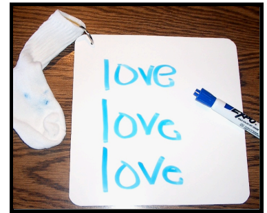
ABC fluency practice.

L-o-v-e spells love. L-o-v-e spells love. L-o-v-e spells love. L-o-v-e, l-o-v-e, L-o-v-e spells love.