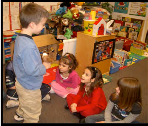
The Friendly Fox puppet helps children take the Kindergarten Friends Challenge.