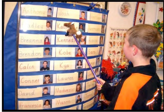
A Name/Picture Pocket Chart invites children to practice quick recall of names.