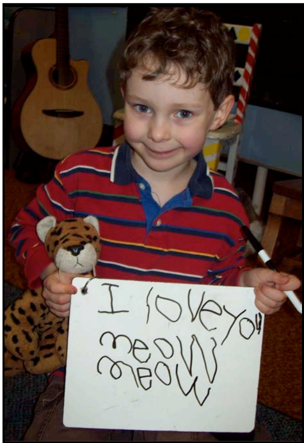
This boy added the name of his stuffed animal "Meow Meow".